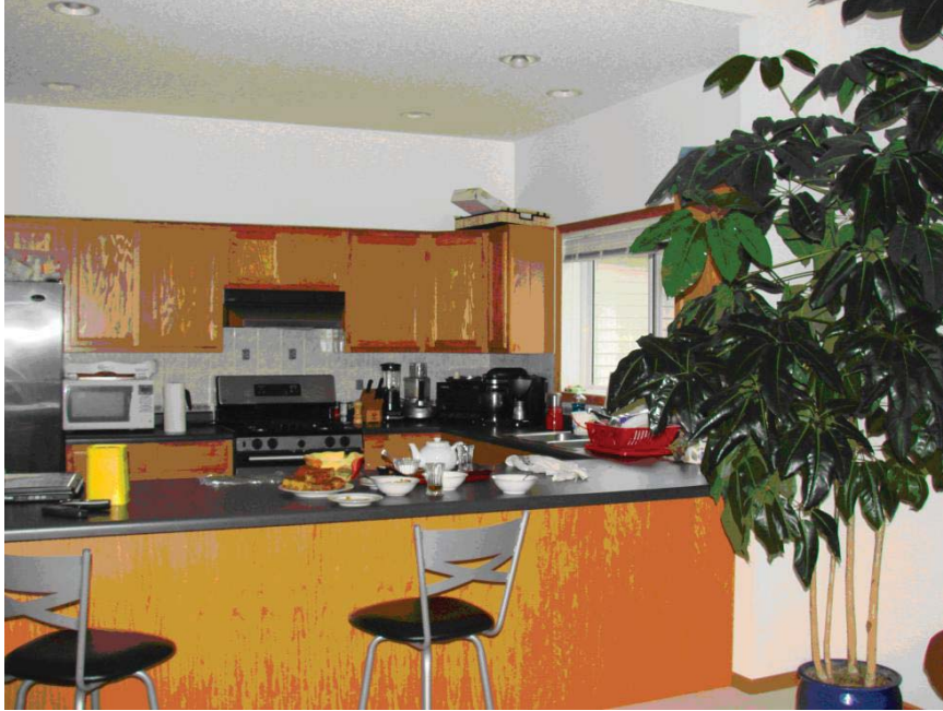
Figure 2: An open kitchen restrains a woman's ability to be unveiled (Source: Authors).

all women will have to remain veiled during the socializing hours.