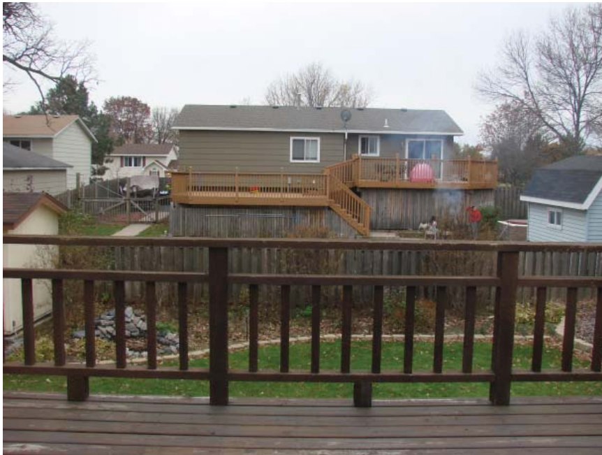
Figure 5: Porch is open to views from neighboring homes.

backyards—when asked about characteristics of their houses back in their home countries which they would like their house in the U.S. to have, most mentioned enclosed backyards. These are domestic open spaces where veiled women can take off their hijabs and enjoy the feeling of sunlight and wind in the privacy of their own home. According to a 22 year-old, in her house in Iran: “We had a hayat [backyard] that had tall walls all around and we had a hoze [traditional pool with a low level fountain] and a variety of trees.” The semi-private green spaces surrounding typical American suburban homes can transform into private backyards by means of tall walls or fences and dense plants as well as techniques such as keeping backyards from facing each other and