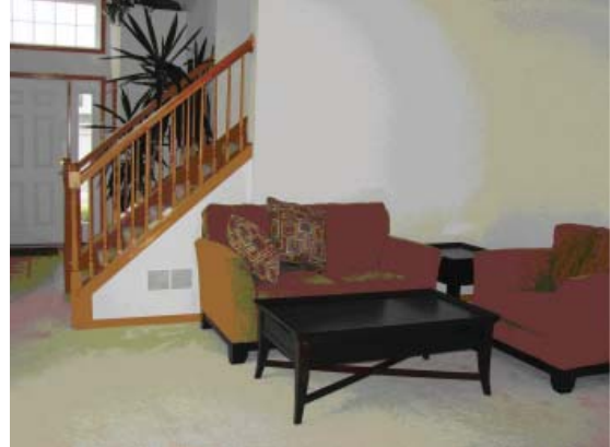
Figure 3: Accessing the stair has no privacy due to sidelights of main entrance.

“Something else that I don’t like is that if someone knocks on the door, I have to walk in front of the door in order to go upstairs and wear my scarf, and they can see me while I go upstairs. So, what’s the point if they can see me? I wish I had a door with a little eye.....There is an issue with American houses....In Saudi Arabia, there is a different door for guests so that they can’t go through the house. Let’s say I have some guests and I want to sneak out, I can’t because they will see me” (Figure 3 & 4).