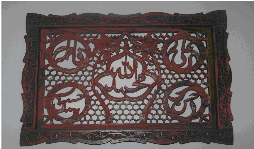
Figure 1: Carved wooden Islamic frame decorates the living room (Source: Authors).

Others, saw the opportunity to stand out in public as the key to acting as ambassadors for their cultural and religious groups because,