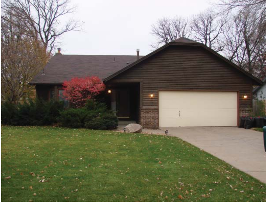
Figure 7: Dense greenery blocks views to the inside (Source: Authors).

such as being safekeepers of tradition and modern gender definitions.