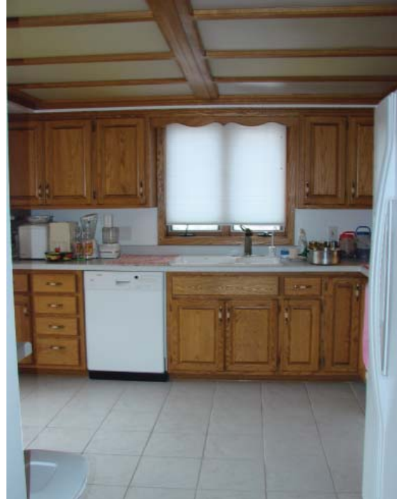
Figure 6: Keeping the blinds down for privacy (Source: Authors).

other trees screened views between homes of neighbors (Figure 7).